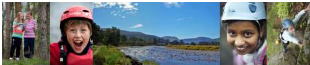
Lagganlia Centre for Outdoor Learning

We still have a number of pupils not making use of our monthly payment plan and have not returned their signed permission slip. Please do not hesitate to contact me should you require further advice regarding payment.